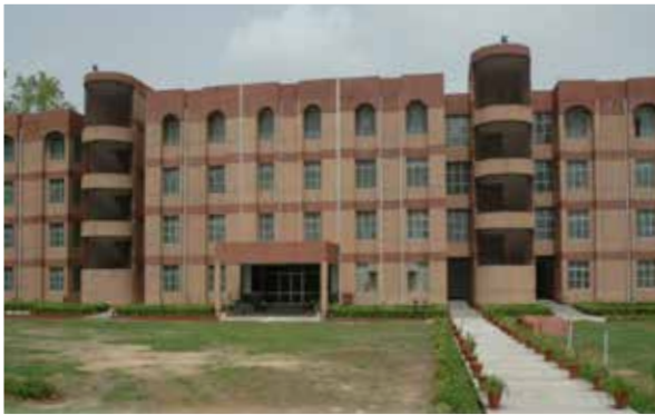
Training Facility Dhansa Road, Bhakargarh, New Delhi India